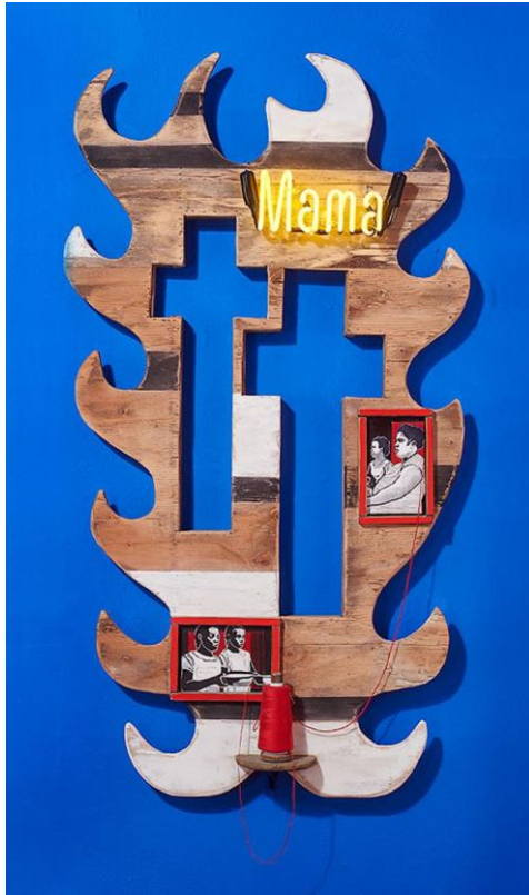
48"x26"x6" carved wood, pencil, paint, thread on paper and neon glass